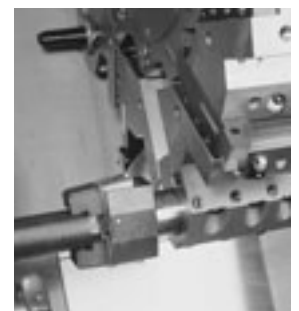
Powerpull on turret pulling bar into position