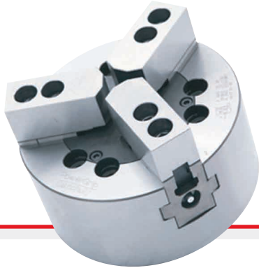
3-jaw wedge-style power chuck