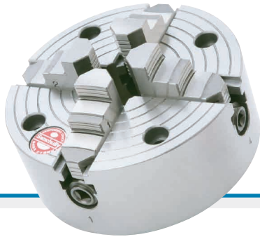
Independent chuck (incl. reversible hard jaws)