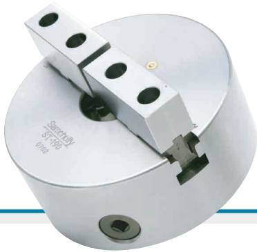
Two-jaw scroll chuck with 2-piece jaw (incl. soft and hard top jaws)